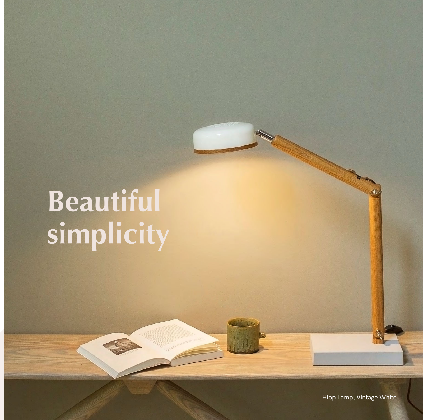
Hipp Lamp, Vintage White