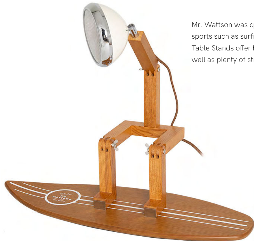
Surfboard Stand (Mr. Wattson not included)

Mr. Wattson was quick to take to adventure sports such as surfing and snowboarding. Both Table Stands offer him new ways to shine... as well as plenty of street cred.