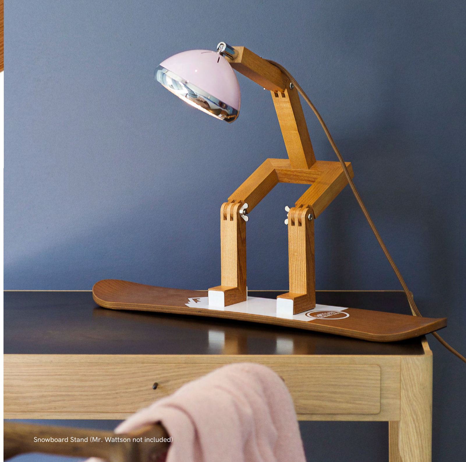
Snowboard Stand (Mr. Wattson not included)