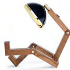
G9-DWR-BMB (Brass fittings)