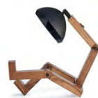
G9-DWR-MB (Black fittings)